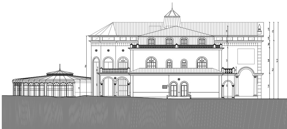
ALÇADO PRINCIPAL (A01)